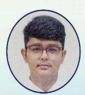
OM RAMI 91.8 %