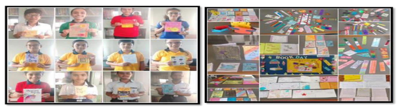
some students did the book review.

<u>Link>></u> Amicus International School library celebrated World Book Day enthusiastically. A variety of activities were planned for all classes to encourage reading habits among students instead of resorting to online media for every solution. Students of Class III to V exhibited their creativity by making some beautiful bookmarks with inspirational reading quotes. Class VI and VII students made cards for world book day. Importance of books was discussed in Class IX and Class X. They designed an innovative Book Cover and